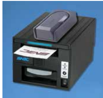
Easily Supports Other Devices, Optimizing Footprint