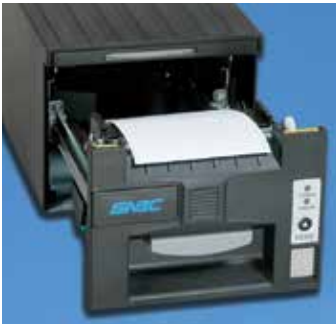
Slide Open For All Operator Tasks Including Drop and Print Paper Loading