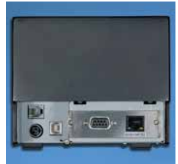
Recessed Connections – Variable Interface Options Available