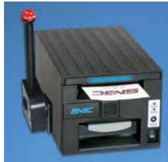
Optional Audio/Visual Print Messenger